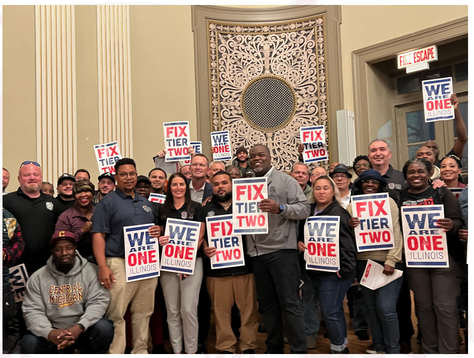
Local Members at the Fix Tier 2 Town Hall

The We Are One Illinois coalition will be holding a rally at the state capitol in Springfield on November 13. For more information, visit www.FixTier2.com